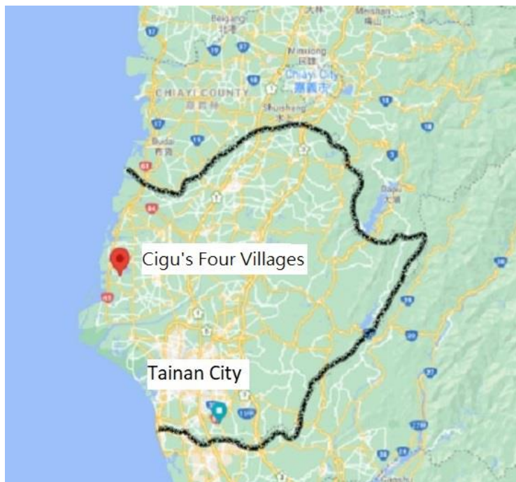
Figure 2 The Location of the Two Study Groups